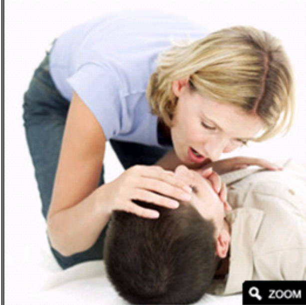
CPR first aid